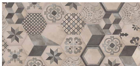
Hex Decor Mix