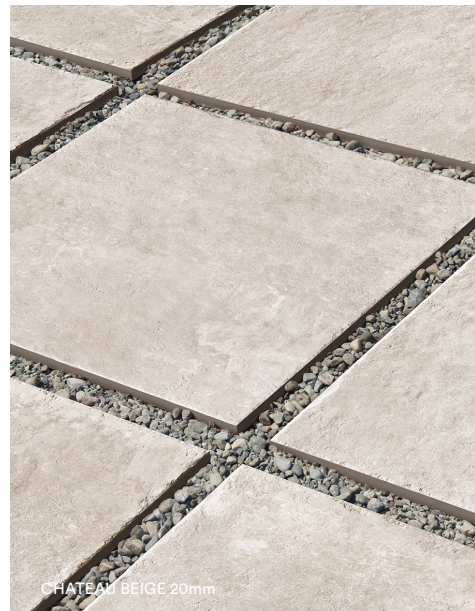
CHATEAU BEIGE 20mm

Chateau draws inspiration from the historic Pierre de Bourgogne stone, combining classic limestone character with a refined contemporary feel. Designed for both interior and exterior use, the durable porcelain surface features subtle fossil-like detailing and soft tonal movement, bringing depth, warmth and understated elegance to architectural spaces.