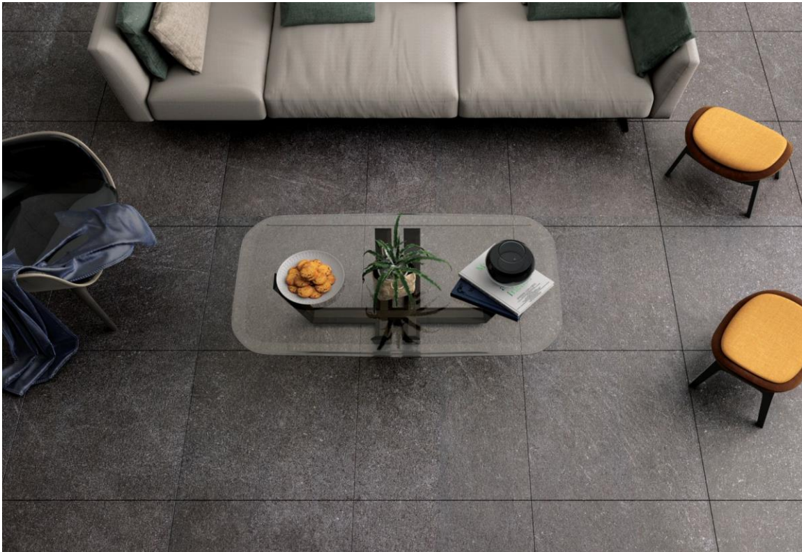
Aspire Coal 600x600mm

Subtle stone designs make Aspire a popular porcelain tile collection. The timeless tones and textures give solidarity and practical aesthetics to any installation both residentially and commercially.